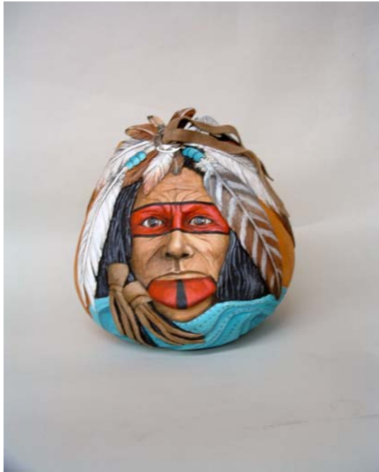
Gourd Indian Face Phyllis Sickles