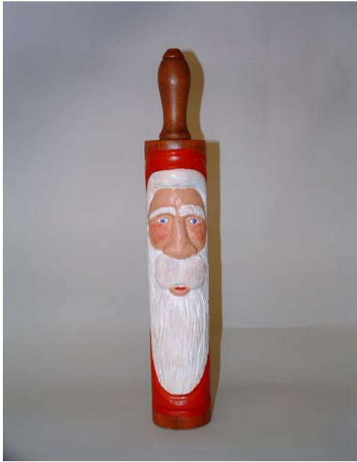
Rolling Pin Carving Chuck Hutler