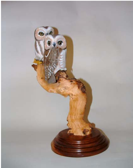
Saw Whet Owl Jim Katchur