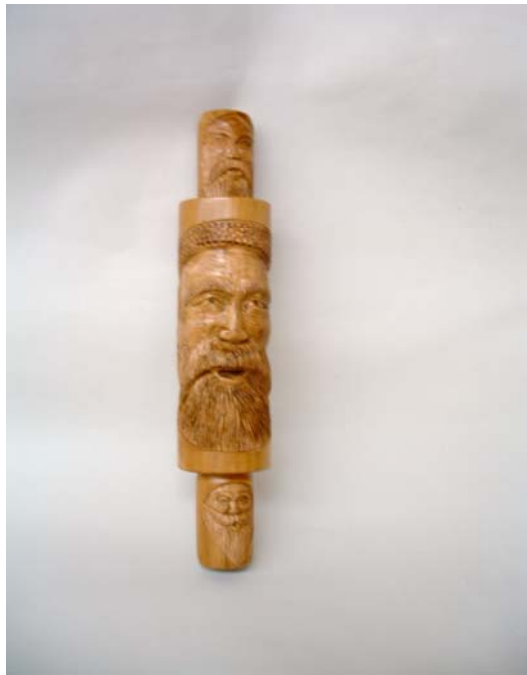
Rolling Pin Carving Chuck Hutler