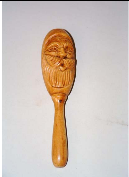
Rolling Pin Carving Chuck Hutler